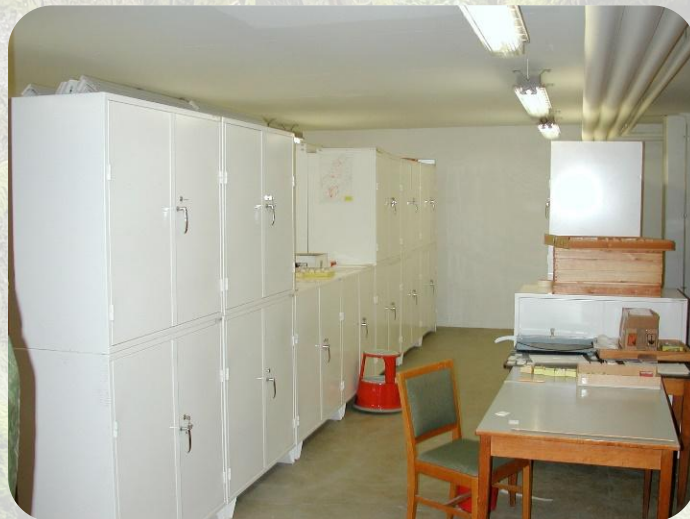
Egg collection 28000 eggs