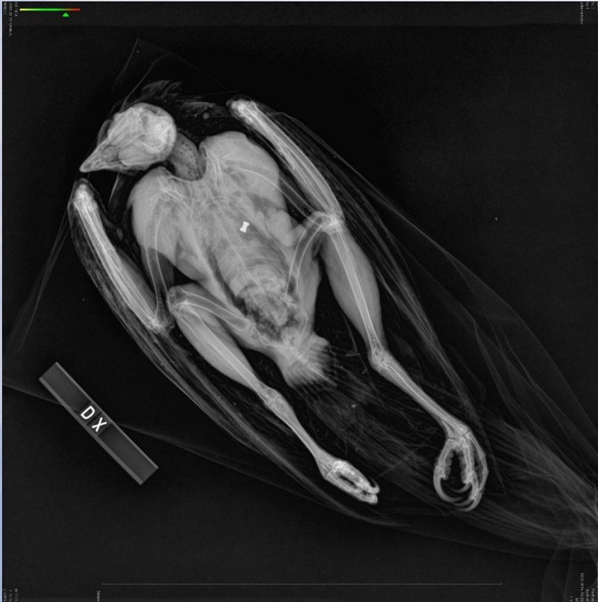
Goshawk Air gun .22 caliber diabolopellet